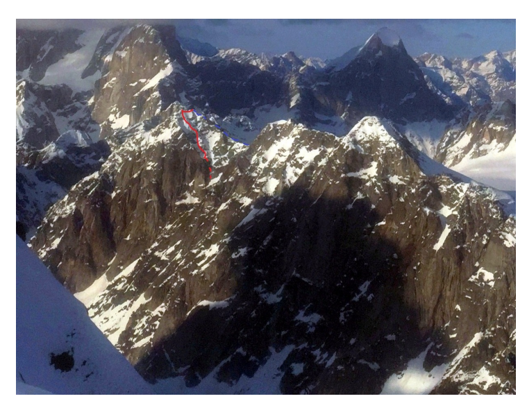
The red line shows the upper portion of the team's new route Pastime Paradise on Peak 7,400'. The