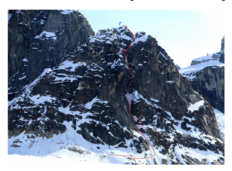
Triple Wannabe Cooloirs (1,800', WI4 5.7) on the southwest face of Peak 5,850'.

blue line shows the south ridge route, well to the right (east). See AAJ 2007 for the latter route.