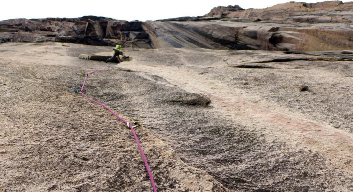
Looking up the crux 5.12a pitch on the Betrayer of Hope (12 pitches, 5.12a), Blow Me Down.