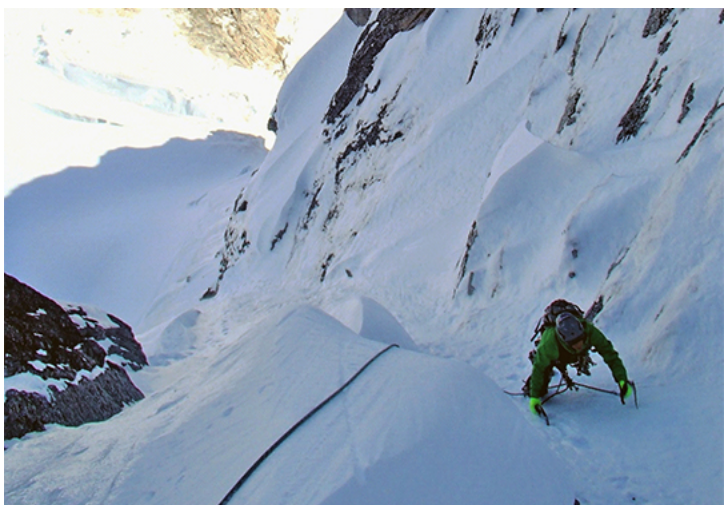
Toshiyuki Yamada following the fifth pitch on It Is What It Is.