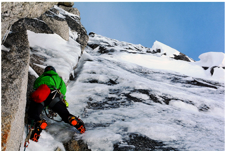
Toshiyuki Yamada heading into the upper crux on It Is What It Is.