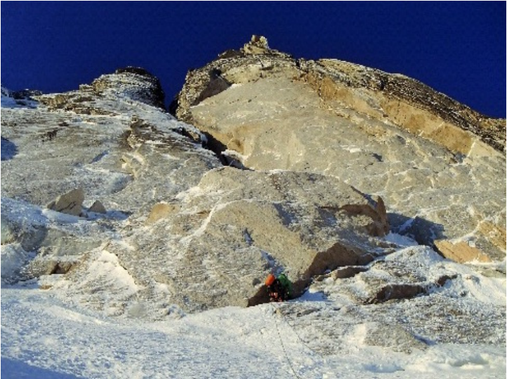
Toshiyuki Yamada heading up the Big Hose.