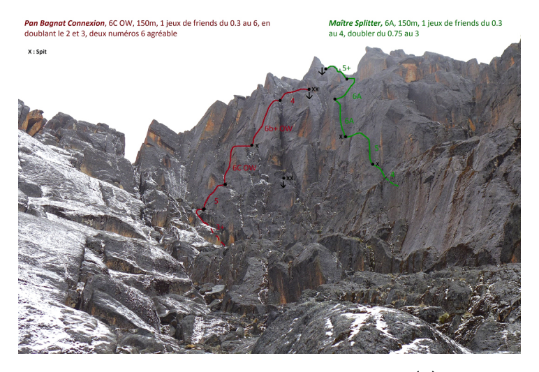
La Vertebra and the new French routes: (1) Pan Bagnat Connection. (2) Maître Splitter.