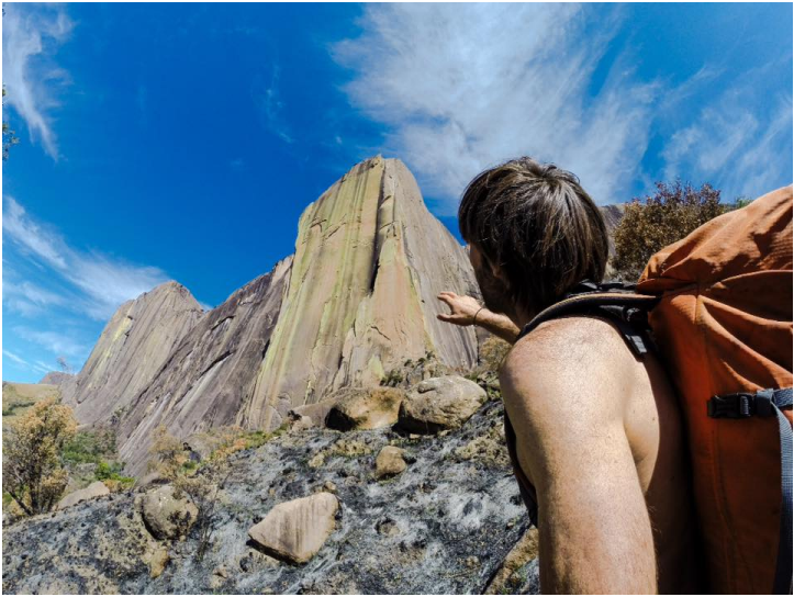
Below the Karambony Wall (right) and Tsaranoro Massif (left).