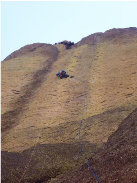
Steep face climbing on Fire in the Belly (700m, 8a+).