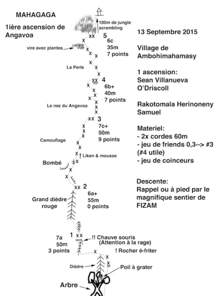
A topo for the new route Mahagaga (250m, 7c+) on the Angavao Wall.