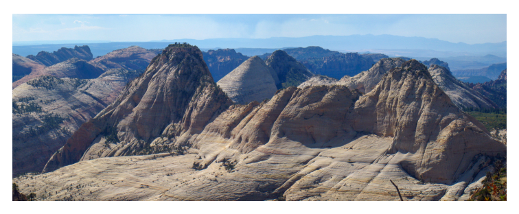
GWD-Stephenson.jpg: Peak 6,991' (Great White Dome) on left and Peak 6,925' (Stevenson Peak) on right. The climbers traversed the skyline at 5.7.