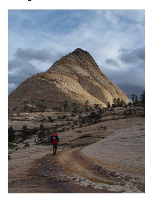
Approaching Peak 6,925' (Stevenson Peak).