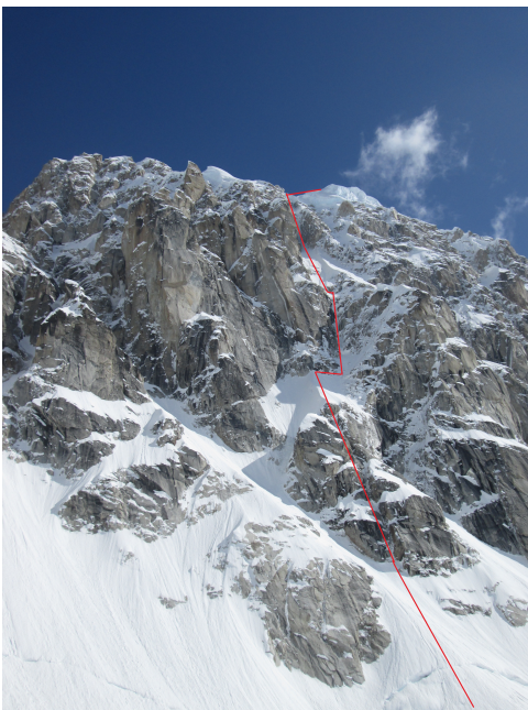
The west face of Peak 11,300 showing the Right Couloir (1983) and the new "sit start."