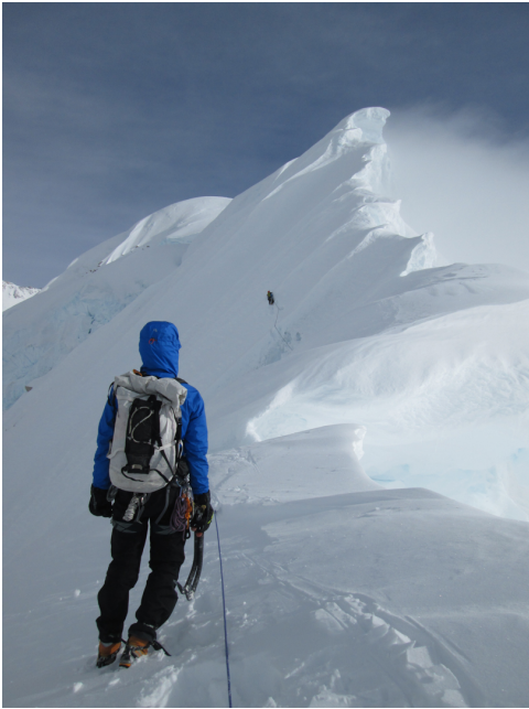
Climbing along the Reality Ridge to the summit of Peak 13,100', "Reality Peak," completing the first ascent of Devil's Advocate (4,200', AI5 M4) up Reality Peak's west side.