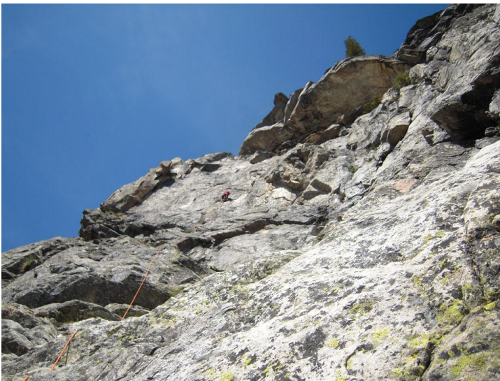
Yuki Fujita below the Entrance Roof.