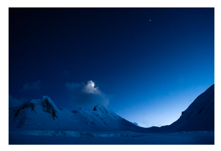
Khafraz under moonlight.