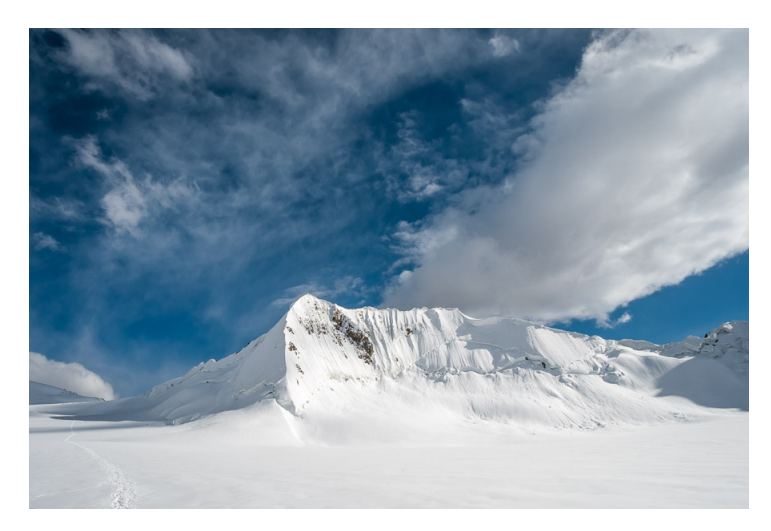
Riga Peak (5,608m).