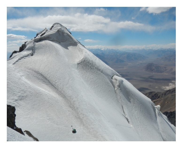
Peak White Piramide.