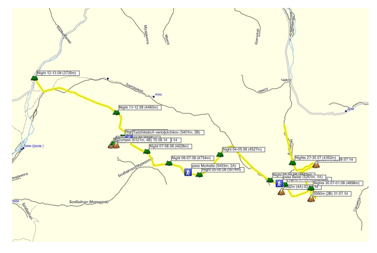
Latvian route across Muzkol Range.