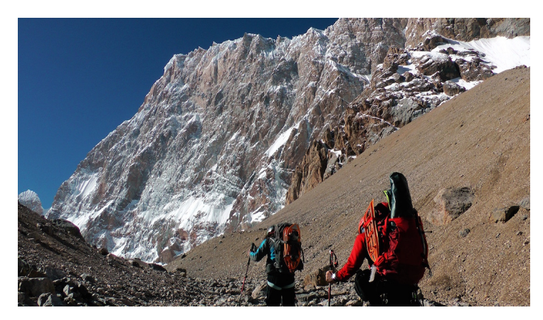
The c a1,700m north face of Durbin Kangri.