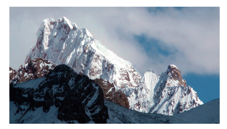
The southwest ridge of Durbin Kangri I.