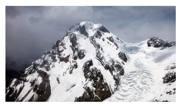
Durbin Kangri II from the southeast.