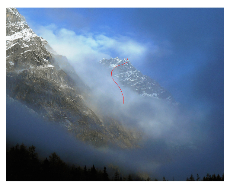
Legends, to the monolithic top of Point 5,182m, above the west side of the Changping Valley.