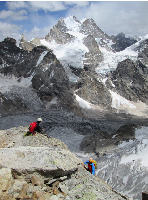
Elias Gmuender and Cyrill Boesch reaching the summit plateau of Lotus Tower, with Ogre III in the background.