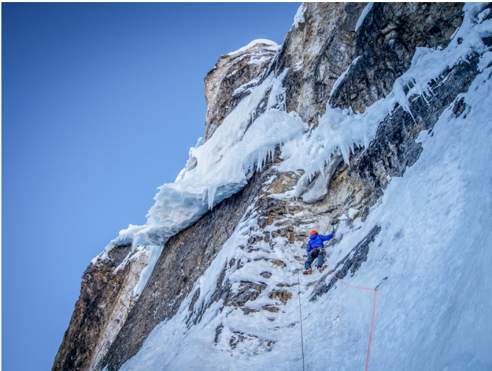
Ben Guignonnet starts day four with a pitch of M5+ at 6,200m.