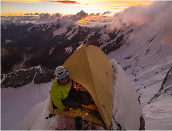
Sunset at the exposed second bivouac on the west face.