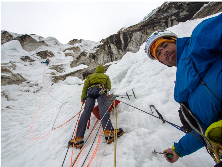
Tackling a steep ice pitch on Looking for the Void, Siula Chico.