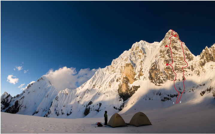
Siula Chico (6,265m) showing (1) Looking for the Void (2014) and (2) Baro-Corominas (2007). Corominas attempted the line of Looking for the Void in 2003, reaching the second bivy site shown, and then a line farther left in 2005. Center: Siula Grande (6,344m). Far left: Yerupaja Sur (6,515m).