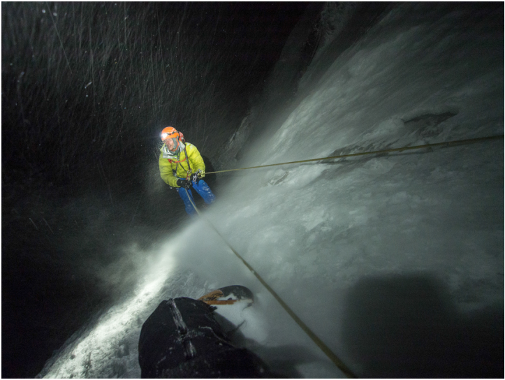
With a clever system for rapid rappels, the team's nighttime descent of the nearly 900m face took only three hours.