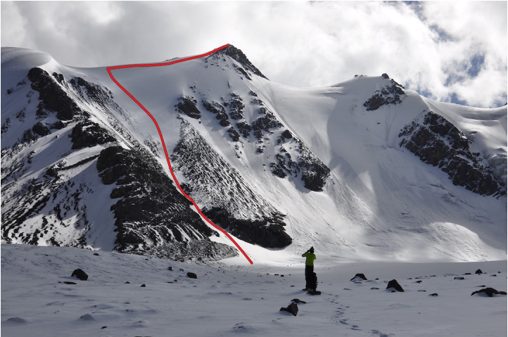
Bars Peak (4,880m) from the northwest.