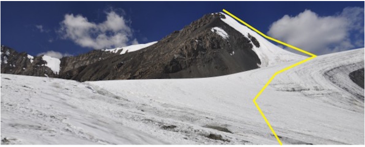
70th Anniversary of SNU Peak (4,880m).