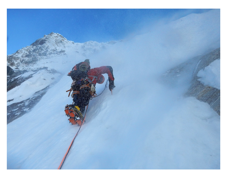
Spindrift on the northeast face of Tawoche Northwest.