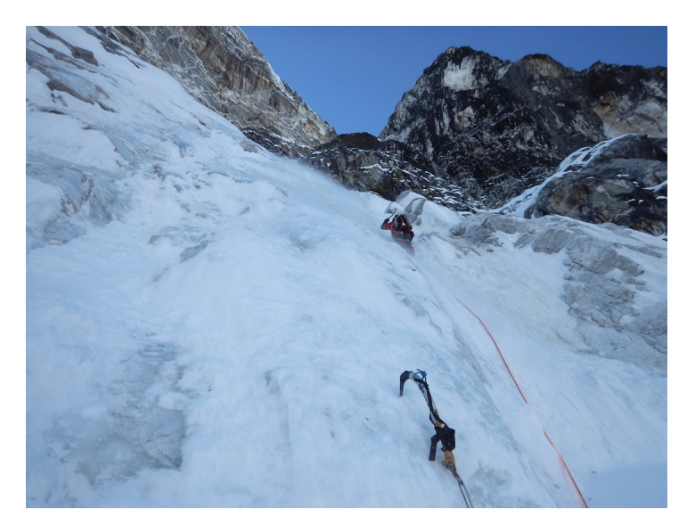
Heading for the narrows in the middle of the northeast face of Tawoche Northwest.