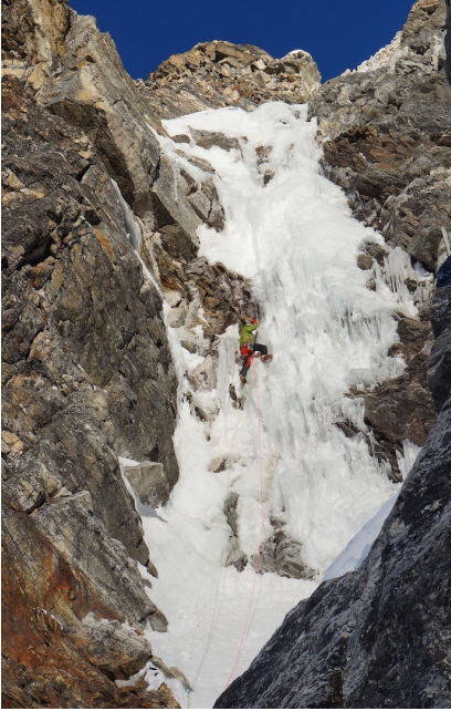
Jordi Corominas leading one of the difficult icefalls on the south face of Chekigo.

North (5,945m); (D) Chugimago (6,258m); (E) Peak 5,794m; (F) Ramdung (ca 5,925m); (G) Peak 5,699m; and (H) Yalung Ri (5,647m).