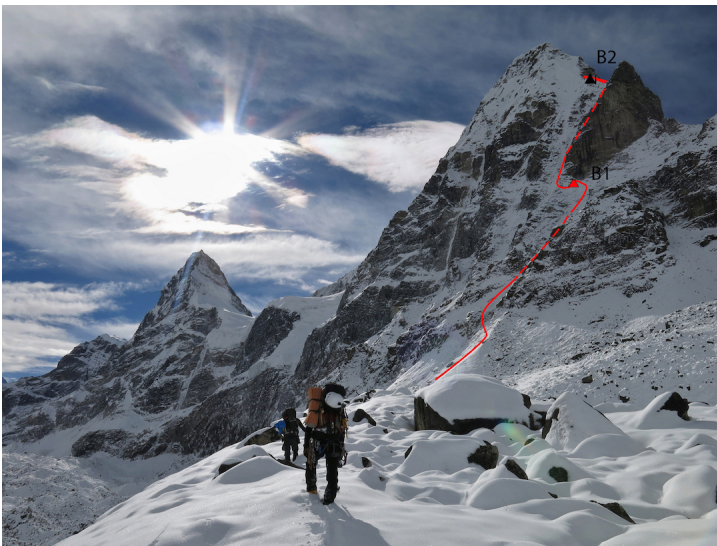
Approaching the Kangcho peaks up the Gyubanare Glacier. Kangcho Shar on left. The attempted route on the north face of Kangcho Nup is marked.