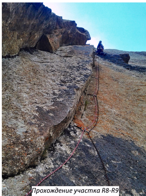
Ninth pitch of the east face of Zhioltaya Stena.