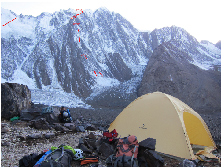
North face of Pik Piramidalny with 2014 French Route. The 2014 Ermishina-Zhigalov route lies on the far left of the face, climbing just right of the conspicuous rightward-rising overlaps.