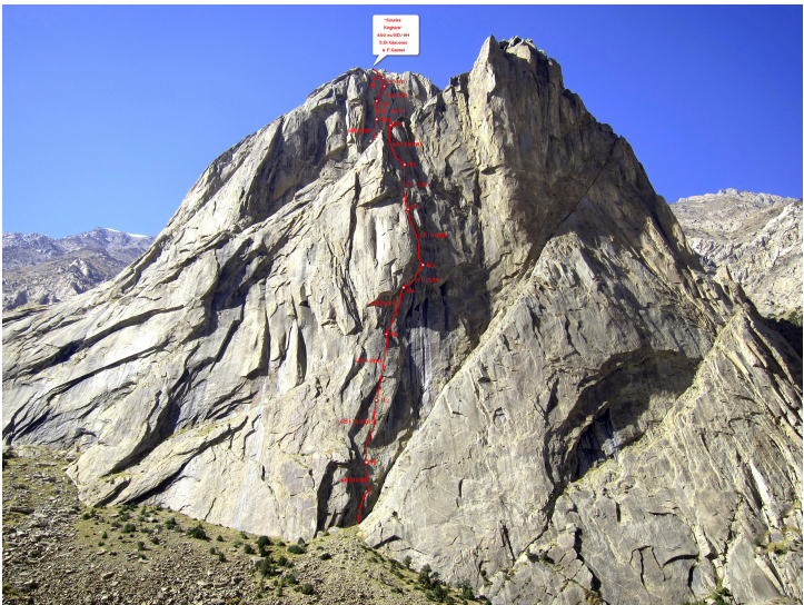
Topo for Sourire Kyrgyz on the Yellow Wall (Zhioltaya Stena).