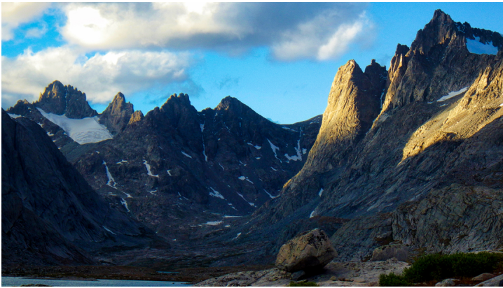
Tower One on Mt. Helen in the alpenglow.