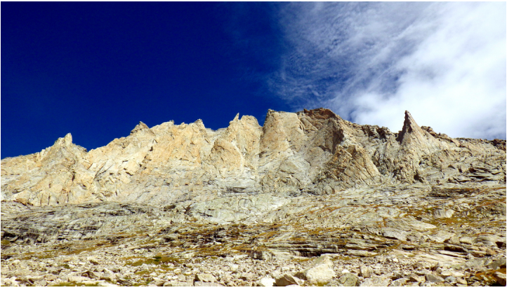
The west face of Fremont Peak, with Red Tower on the right skyline.