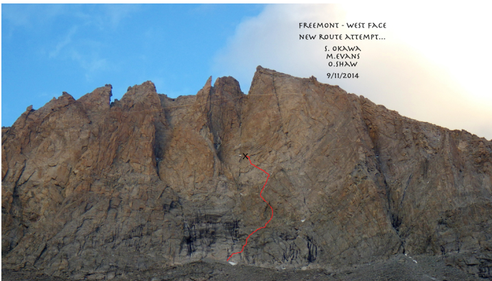
The Evans-Ohkawa-Shaw attempt (2014) on the west face of Fremont Peak.