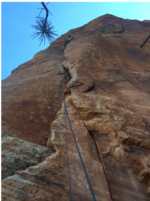
Looking up the crux pitch (5.11c) of Watchman Direct.