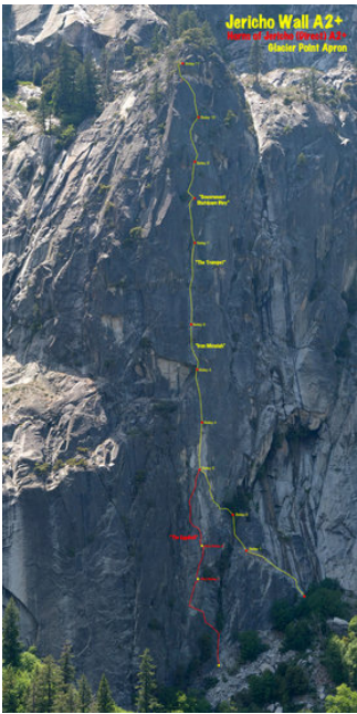
A photo topo of the Jericho Wall, showing Jericho and the direct start Horns of Jericho.