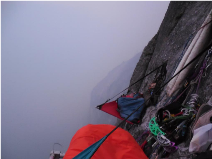
The ash of the Rim Fire cloaks the sky at what came to be know as the Government Shutdown Bivy.