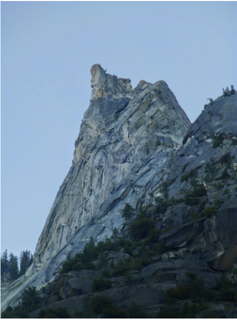
The northeast side of the Sphinx.