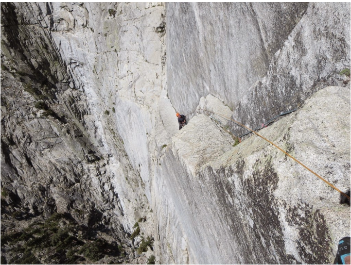
Looking down the second pitch of Cotton Mouth Khafra.