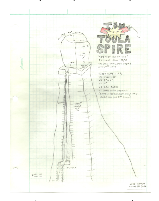
Topo for A Better Way To Die (2 pitches, 190', 5.10+ R/X) on Tim Toula Spire.