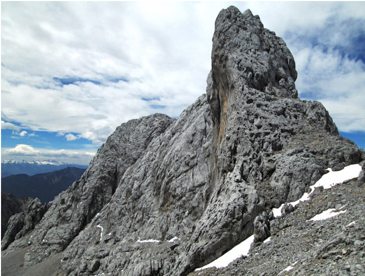
Unclimbed rock tower on the Jidege Ridge.