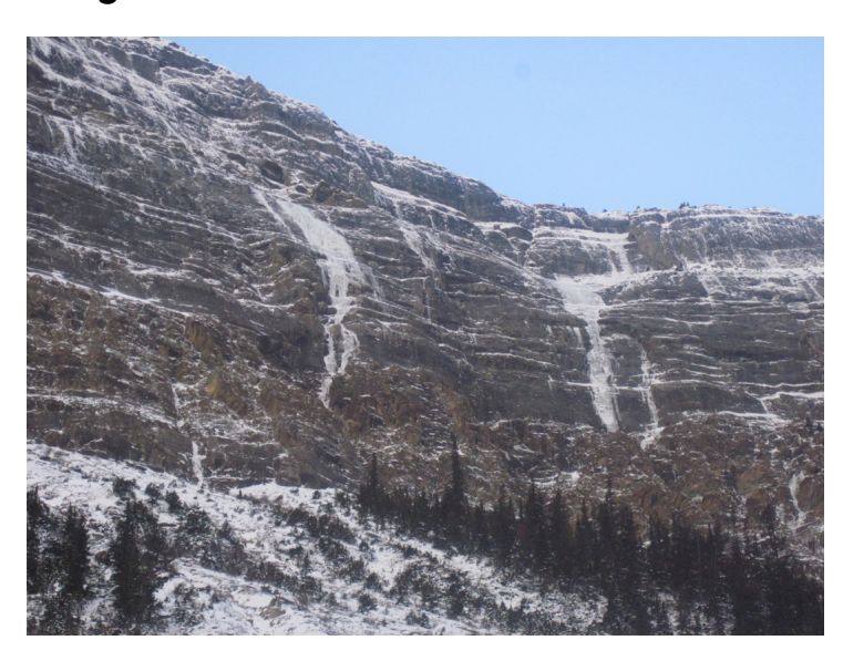
The northeast face of Capricorn Peak. The right ice line is Space Goat (320m, WI5+ X M5), and the obvious one to the left is Big Ears Teddy (300m, WI4 R M4 X).