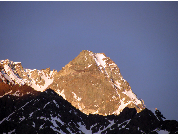
Unnamed peak in the Las Leñas Valley.