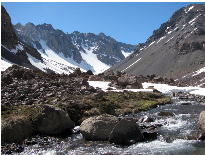
The beautiful Cajón de Espinoza.