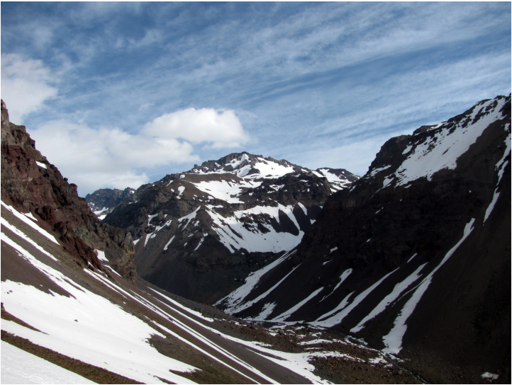
Cerro Manuel Rodríguez as seen from Cajón de Espinoza.