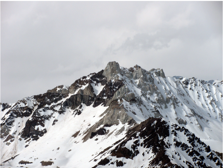
Unnamed peak in the Las Leñas Valley.