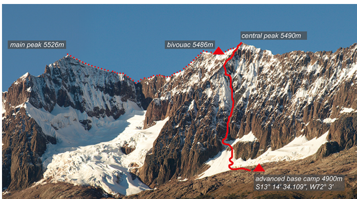
The north (main) summit of Nevado Chicon (5,526m) on the left and the slightly lower central peak (5,490m) on the right, with the route of ascent and traverse between the two peaks shown. The Chicon massif continues south out of frame and encompasses other tops and new-route possibilities.