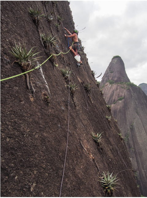
Lead-bolting the 7c crux pitch prior to it being climbed free.