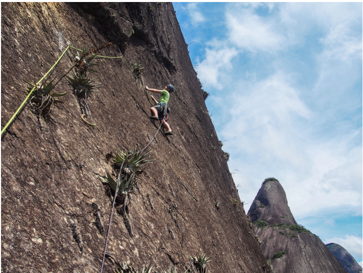
Face climbing on the 7c crux pitch of Obrigado Amigos (650m, 7c).