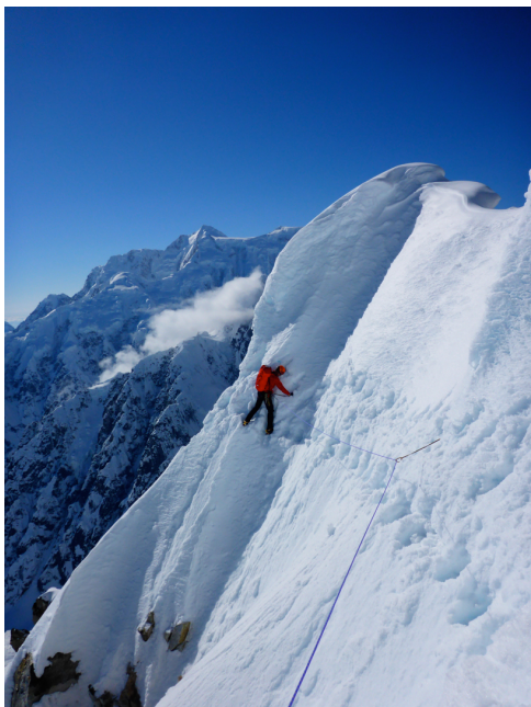
Aaron Child traversing along the south ridge of Idiot Peak.