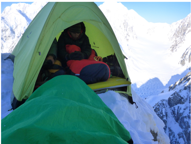
Hanging out at the Thank God Mushroom Bivy.