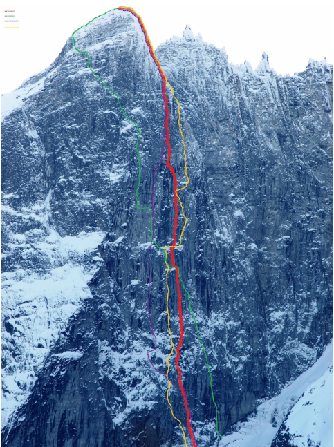
Red: Katharsis. Green: Arch Wall. Purple: French Route. Yellow: Russian Route.