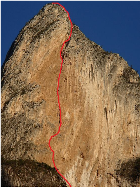
The northwest face of Las Guacamayas, showing the new route Confabulación C3smica (400m, 13 pitches, V 5.12a). The wall is located in the Parque Nacional Cumbres de Monterrey in northeastern Mexico.