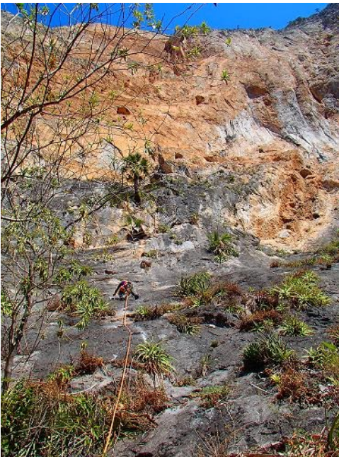
Starting up the first pitch (5.7) of Confabulación Cósmica, which quickly leads to the steep orange limestone above.