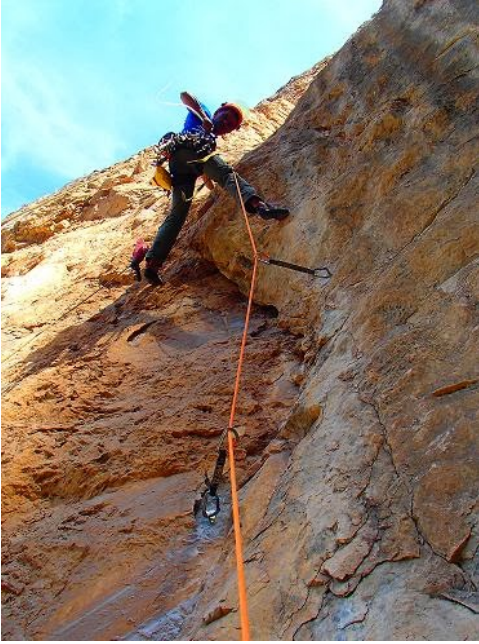
Leading up steep and featured orange limestone midway up Confabulación Cósmica.