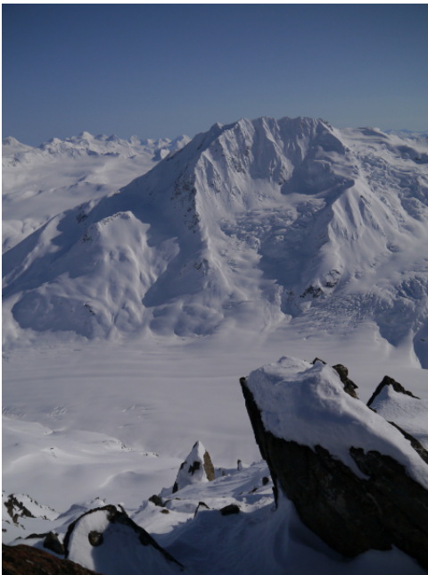
An impressive view of the unclimbed northwest face of Whitecrown (6,390'), as seen on a previous trip.