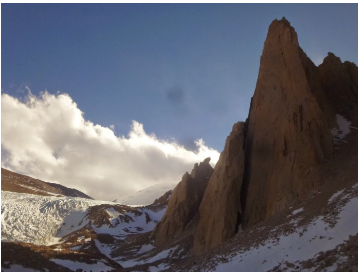
The tower NicoMade on the right and the Glaciar la Fría snaking upward toward Ansilta 7 on the left.