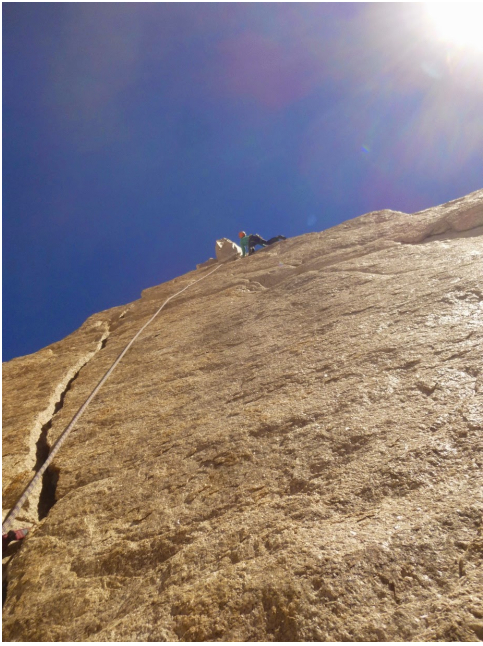
Blue sky and splitter hands on Alegria.