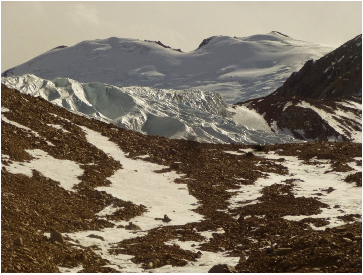
Looking west up the large Glaciar la Fría toward the summit of Ansilta 7 (5,780m). The tower Nico Made is located out of picture to the right.