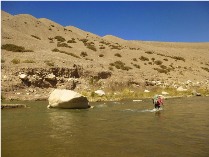
Crossing the Río Blanco on the approach to Ansilta 7.