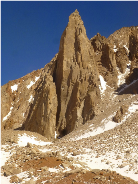
The impressive, newly climbed tower Nico Made. Alegria(230m, 6c) climbs the right side of the aspect shown.