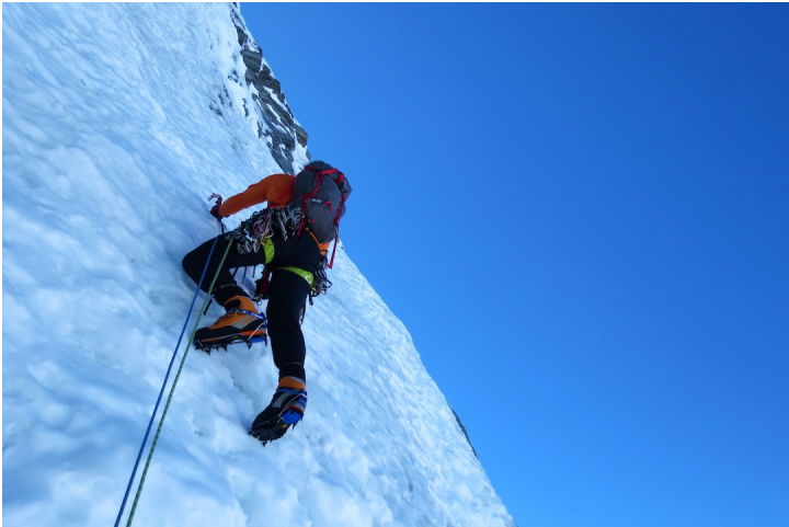
Steep ice on Shooting Star, Mt. Aspiring.