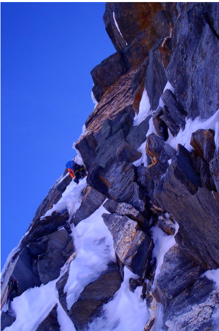
Mixed terrain on Shooting Star, Mt. Aspiring.