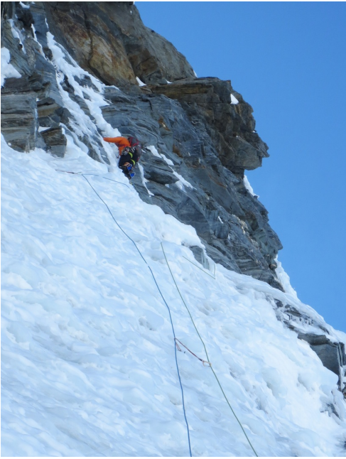
Climbing on Shooting Star, Mt. Aspiring.