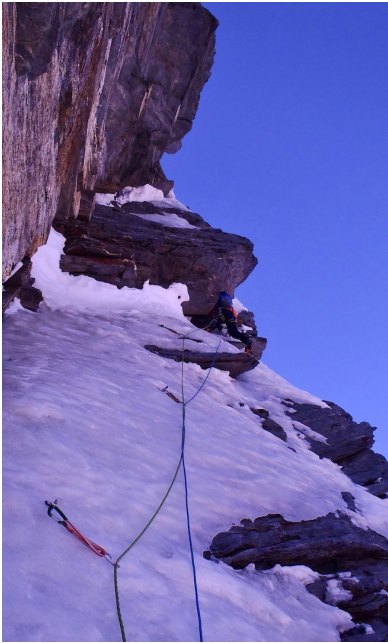
Climbing on Shooting Star, Mt. Aspiring.