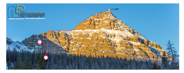
An overview photo-topo for the new routes on Reids Peak. (1) The One Who Knocks (550', WI6 M5 R/X). (2) Golden Spike (345', WI4 M5 R).