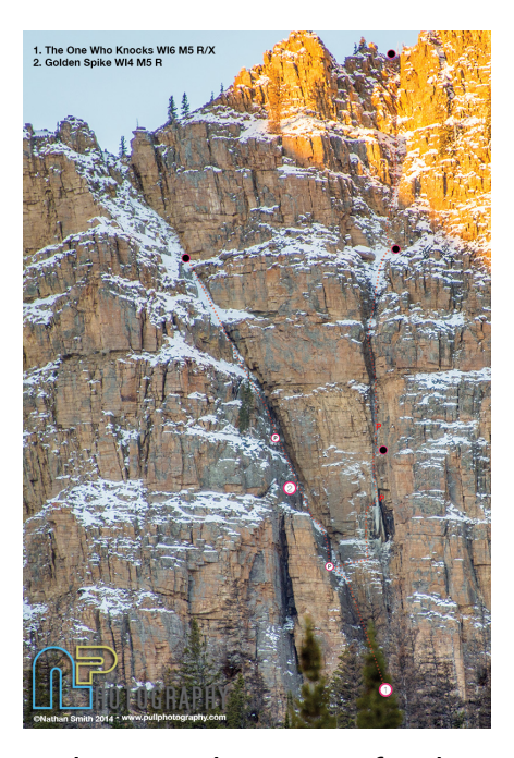
A close up photo-topo for the new routes on Reids Peak. (1) The One Who Knocks (550', WI6 M5 R/X). (2) Golden Spike (345', WI4 M5 R).