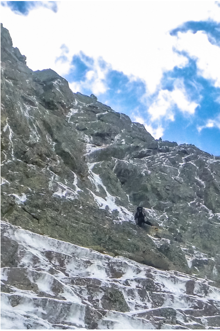
Erik Rieger leading up the icy upper corner system.