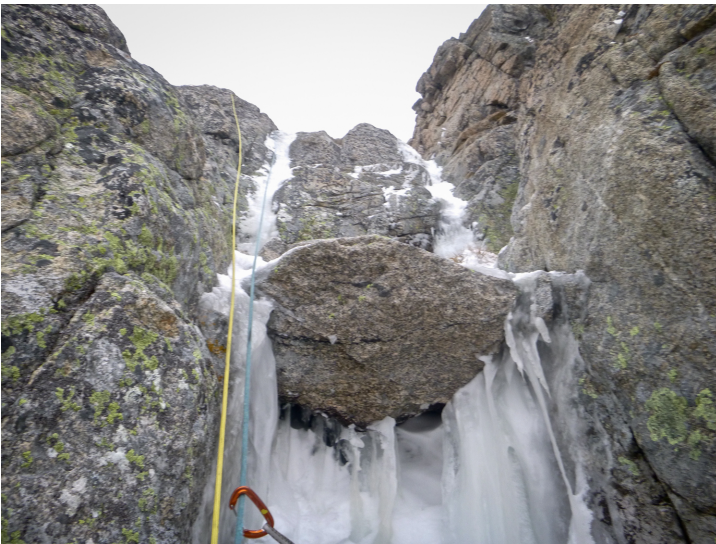
Part way up the icy corners on the first pitch of Stalker.