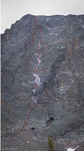
The north aspect of Peak 12,878' (a sub-peak of Shoshoni Peak), showing the route Stalker (1,100', WI4 M5) in mid-September conditions. Fill in the blank spots with ice and you'll get the idea.