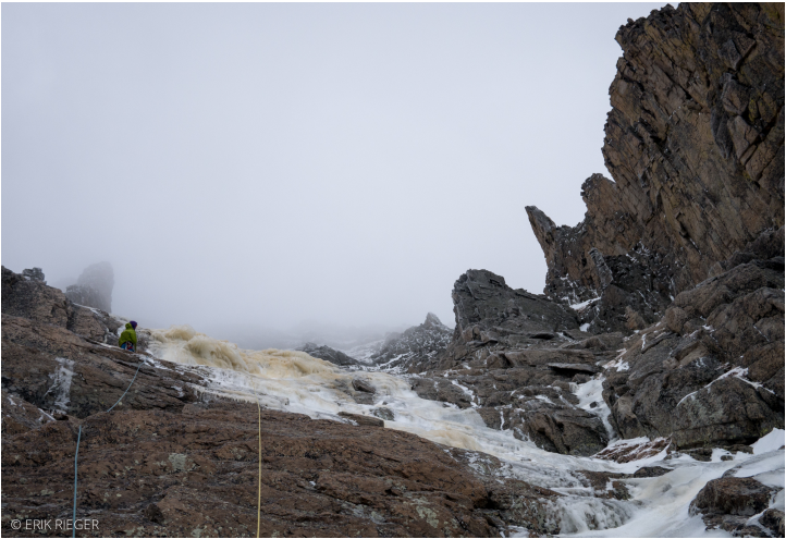
Climbing moderate and thick ice above the steep smear.