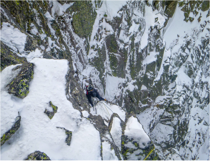
Erik Rieger following the second-to-last pitch.