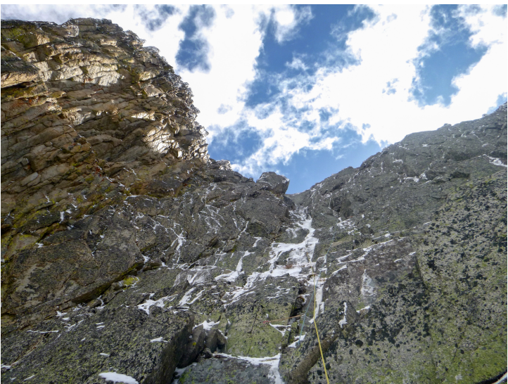
A close-up of the upper corner system.