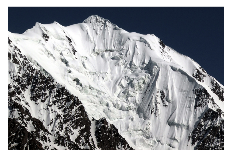
Unclimbed northwest face of Koh-e-Brobar.

Looking approximately south as a climber arrives on Sun Terrace of south-southeast ridge of Koh-e-Brobar. In left middle distance are peaks of Chot Pert Group, while to right are big peaks north of Hispar Glacier.