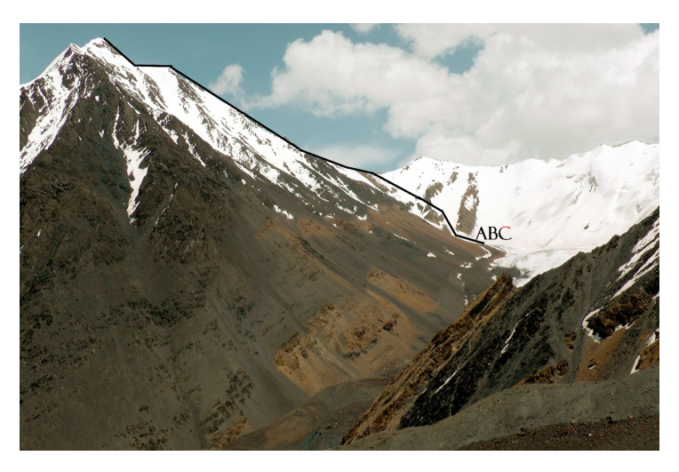
Kohi Brobar from west, showing high camp and route of ascent.