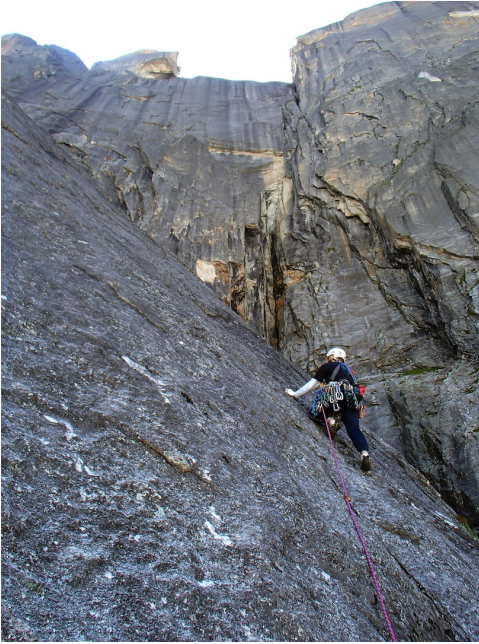
Slab pitch in the central section of the Japanese route on Shizi.