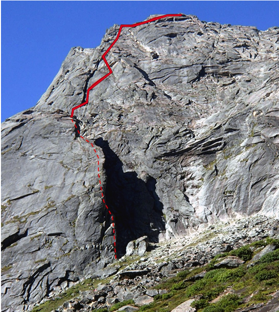
Japanese route on Fenghuang.