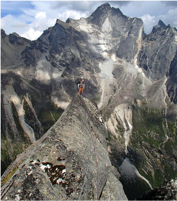
The summit ridge of Fenghuang, with Dagou West (5,422m) in the background.