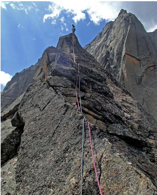
Reaching the summit of Fenghuang.