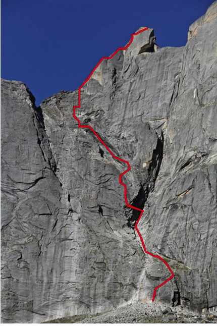
Japanese route on Shizi.