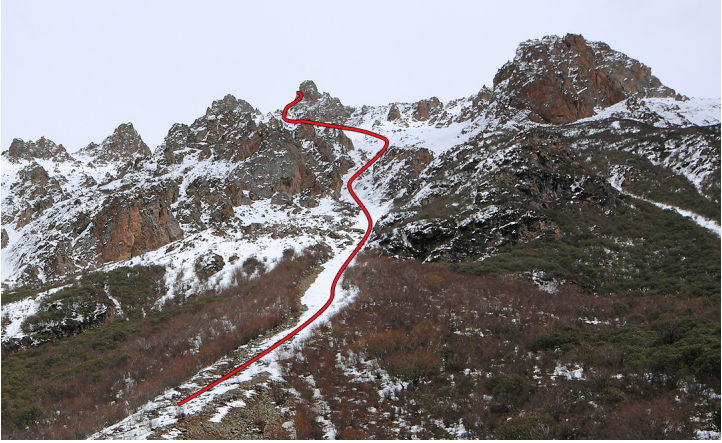
The route Horses on the northwest face of Khai Ri