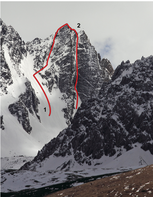
Tsara Mashe Ri from the west. (1) Descent on the northwest face. (2) Taxi Driver.