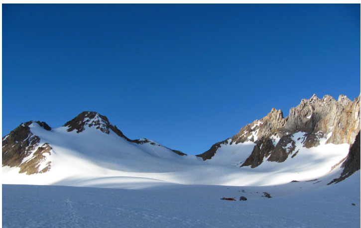
The view from the first of two base camps, this one on the University Glacier. The peak on the left is Pilar Meridional.