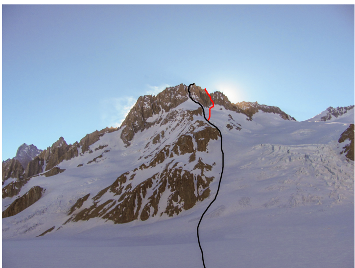
Corona del Diablo and the routes to main summit (black) and secondary summit, Nor-Este Torreón (red).