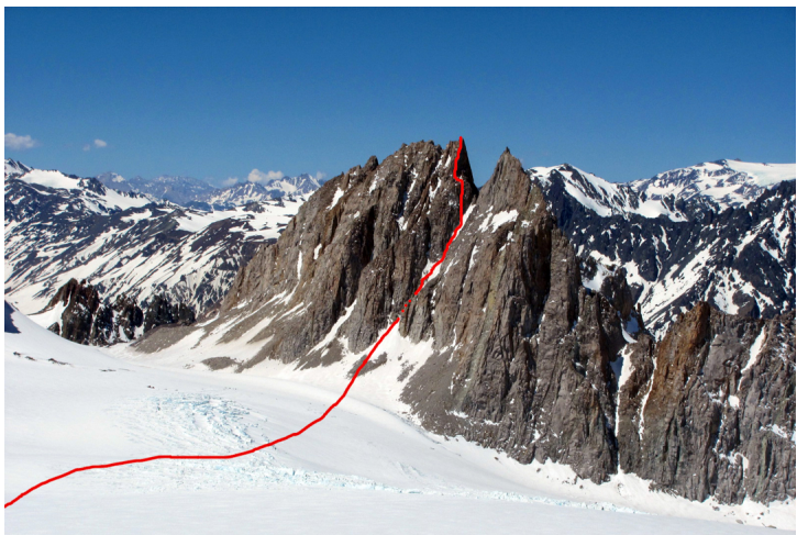
The route to the main summit of Gran Torre del Cortaderal.