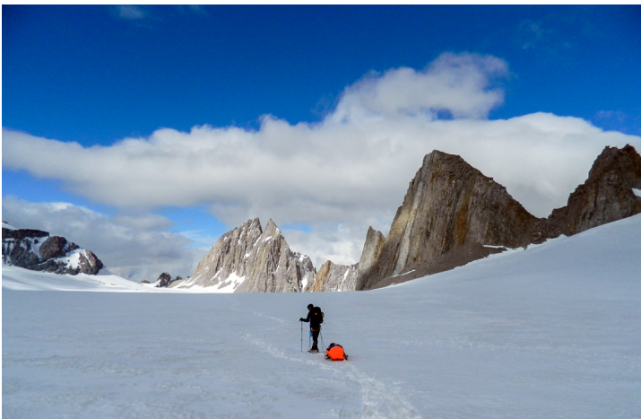
Arriving on the Cortaderal Glacier. Gran Torre del Cortaderal (left) and unnamed peak (right).