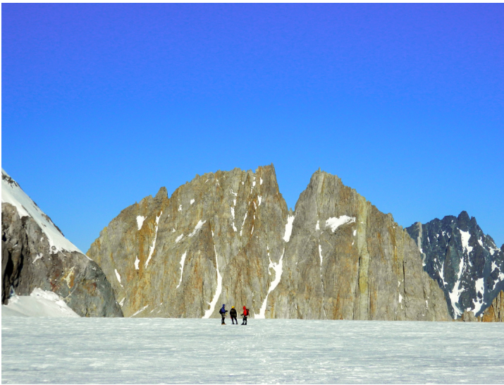
2: Gran Torre del Cortaderal from the Cortaderal Glacier.