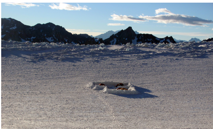
The second of two base camps, this one on the Cortaderal Glacier (ca 4,000m).