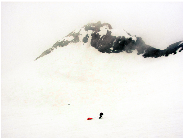
Dragging sleds under the Pilar Meridional.