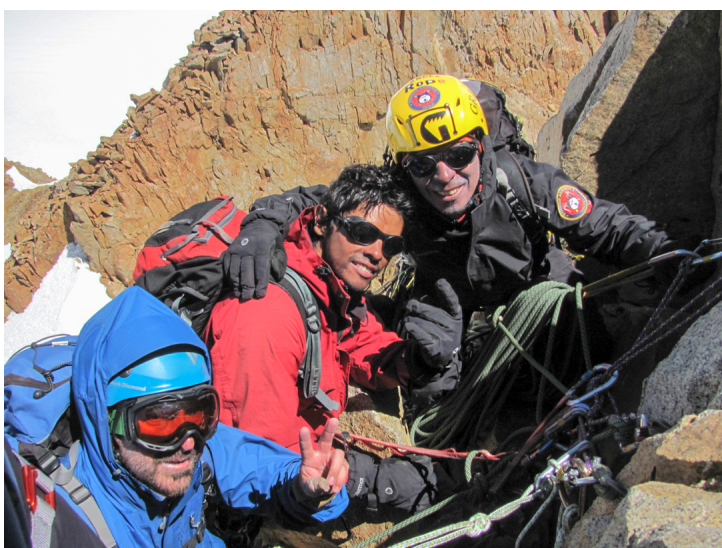
On the summit of Pilar Occidental.