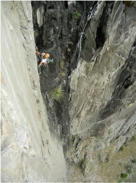
Following one of the lower-down pitches.