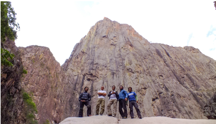
The team poses below El Gigante.