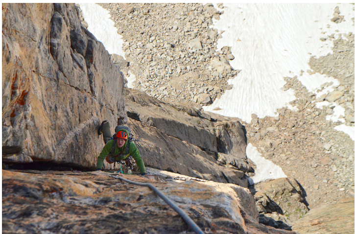
Blake McCord following the crux pitch on the West Face Dihedral.