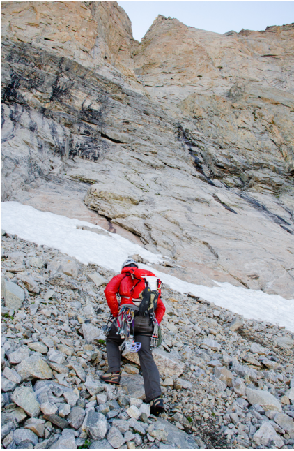
Matt Spohn approaching the West Face Dihedral on Fremont Peak.