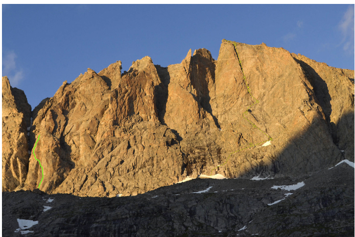
The west face of Fremont Peak. The green line marks the attempted new route, and the yellow line marks the West Face Dihedral (the circles indicate belays).