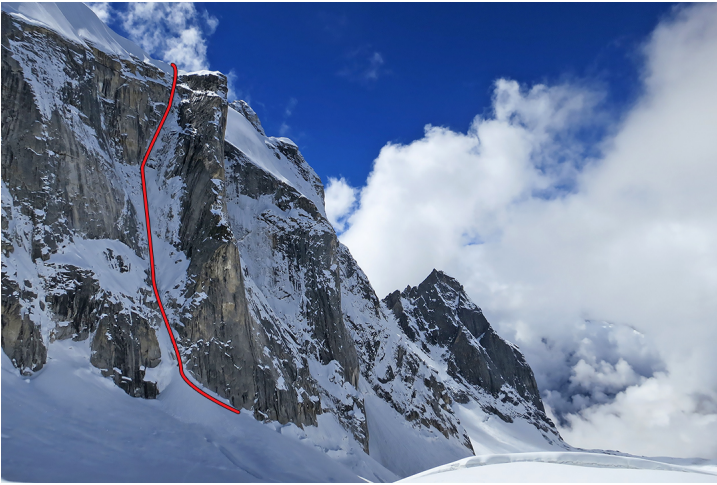
The north couloir of Ice Wave West.