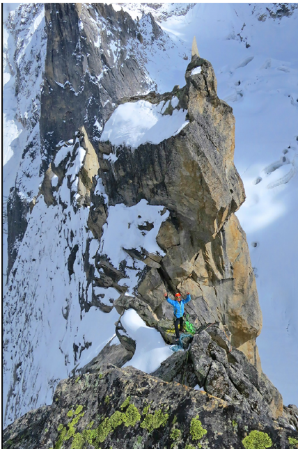
Caroline North on the final section of the Cathedral.