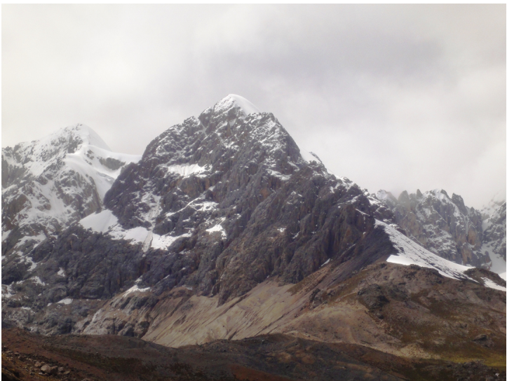
Nevado Tatajayco's northwest ridge forms the right skyline. The new route A Puro Huevo climbs the apex of the ridge for its entire length and tackles the short headwall midway up directly.