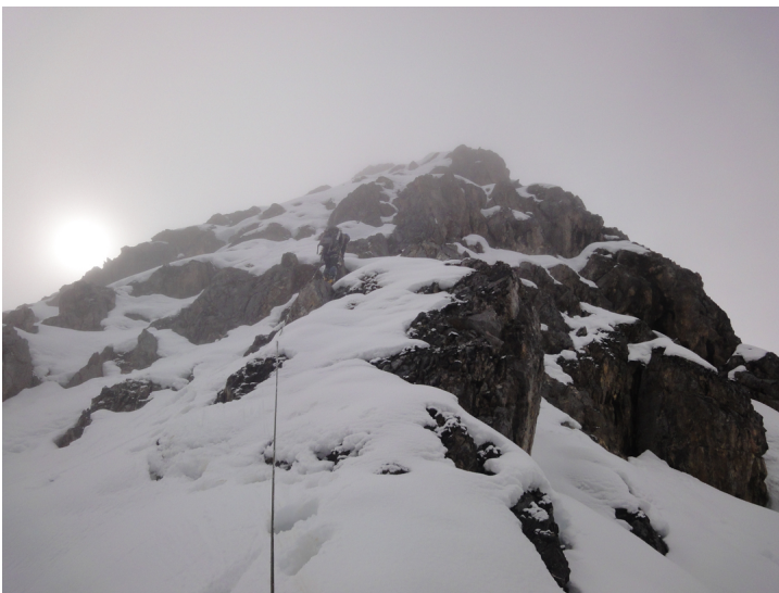
Typical climbing along the ridge.