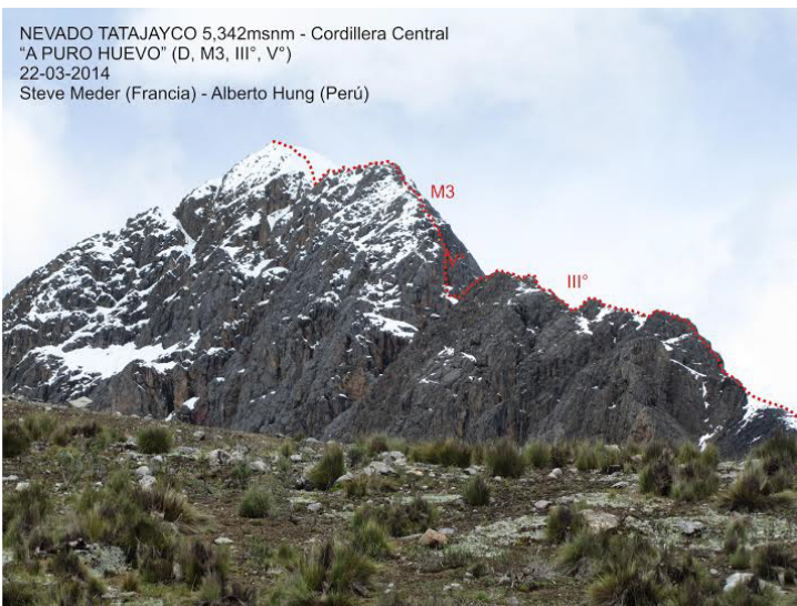
A photo topo of the route A Puro Huevo, up Nevado Tatajayco's northwest ridge.