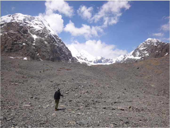
Approaching Quiullacocha Valley.