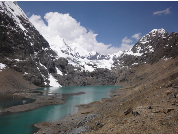
Laguna Quiullacocha and surrounding peaks.