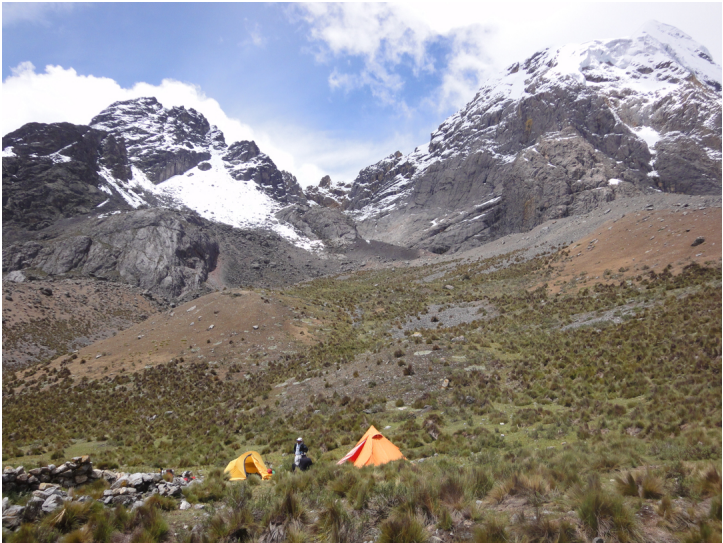
At camp in the Quiullacocha Valley.