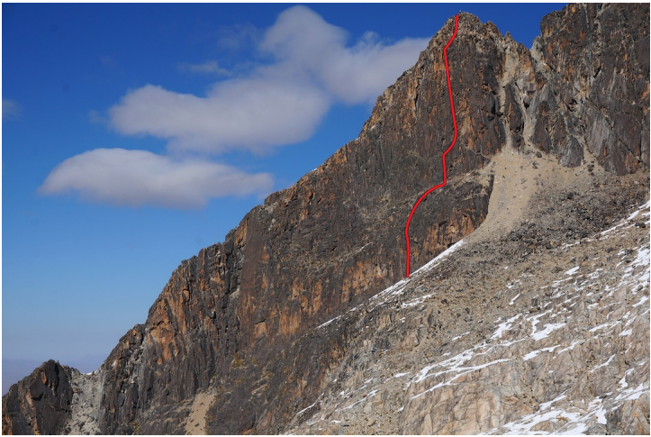
The lower south summit of Pico Milluni with Ruta de los Vikingos; the descent was by the obvious gully system to the right. Part of the higher south summit, climbed on this side by the Black Condor, is visible at right.