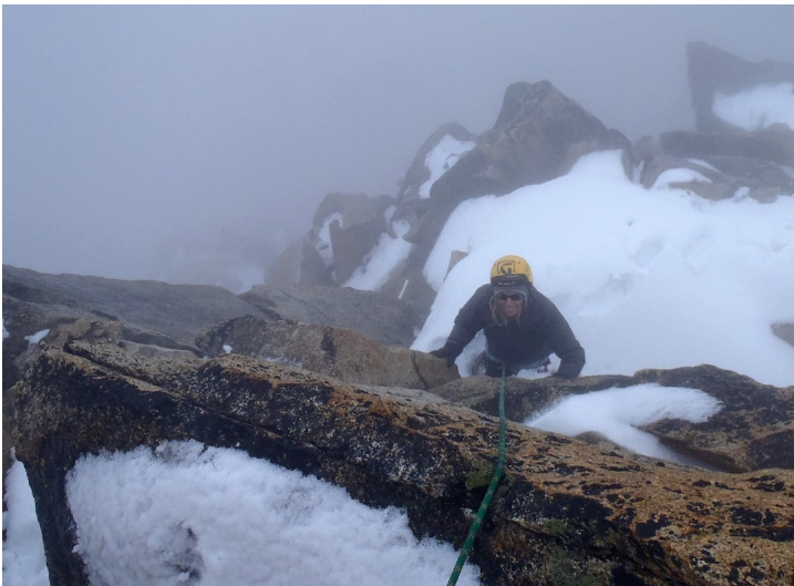
Sal Beisly enjoying typical wet-season conditions on the northeast face of Pico Milluni.