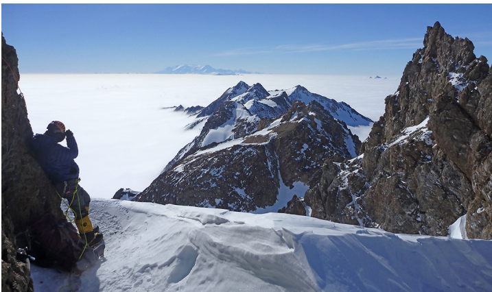
Ralf Laier looks north along the Soholt crest from the col beneath Cerro Catedral. Craddock and Vinson Massif are visible ca 120km distant.