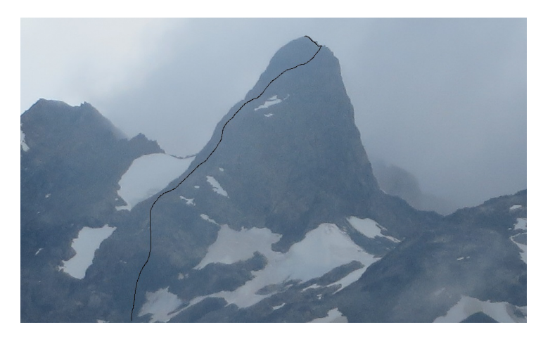
The route on Peak 1,960m's south face.