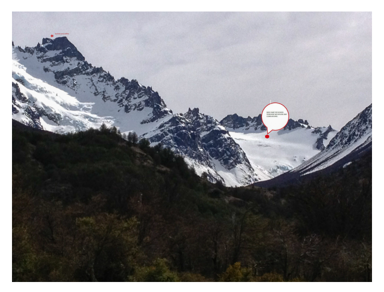
Base camp (right) and the summit of Cerro Penon (left).