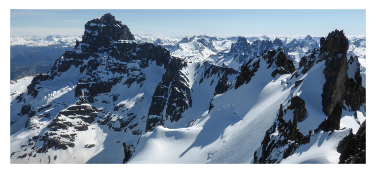
Looking south at Cerro Castillo from the summit of Cerro Penon.